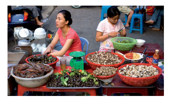
All the ingredients for a grilled seafood feast

of Vietnamese imperial cooking, which features a range of sophisticated, refined dishes designed to tempt jaded royal appetites of yore.